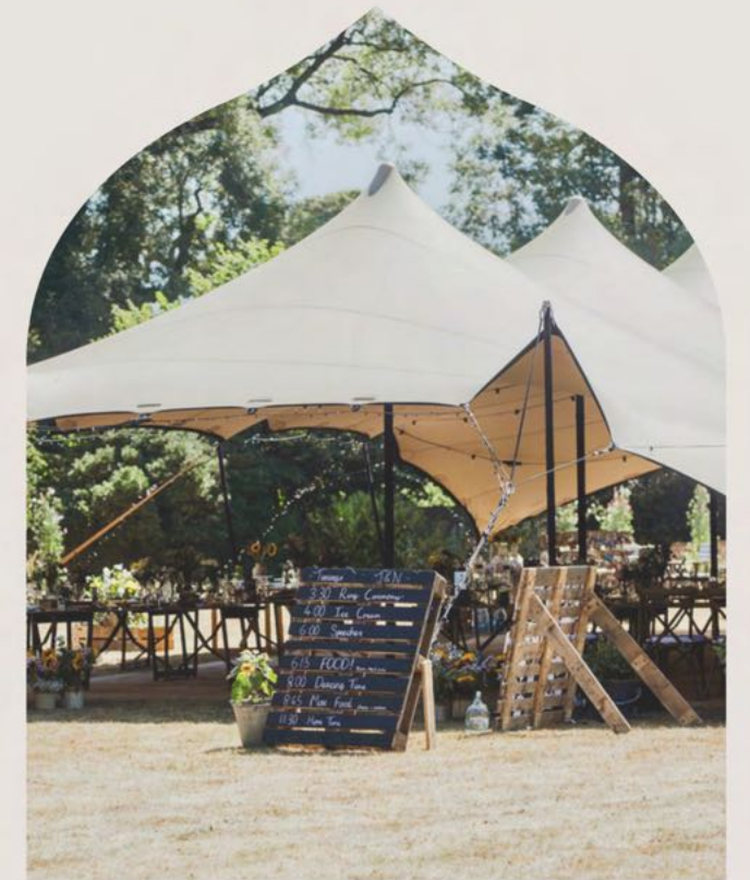
THE STRETCH TENT