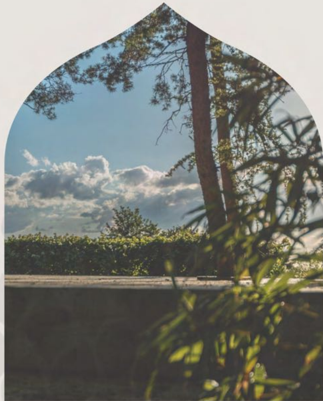
THE SUNSET DAIS

At Purusha we've lots of dreamy spaces both indoors and out for you to use during your celebration to give you plenty of options on how to plan your day.