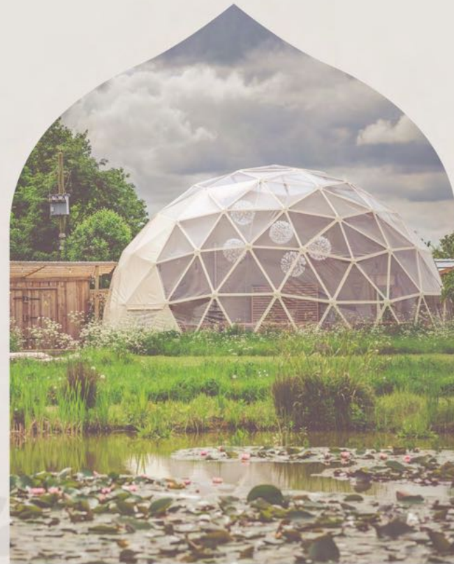
THE KULA DOME