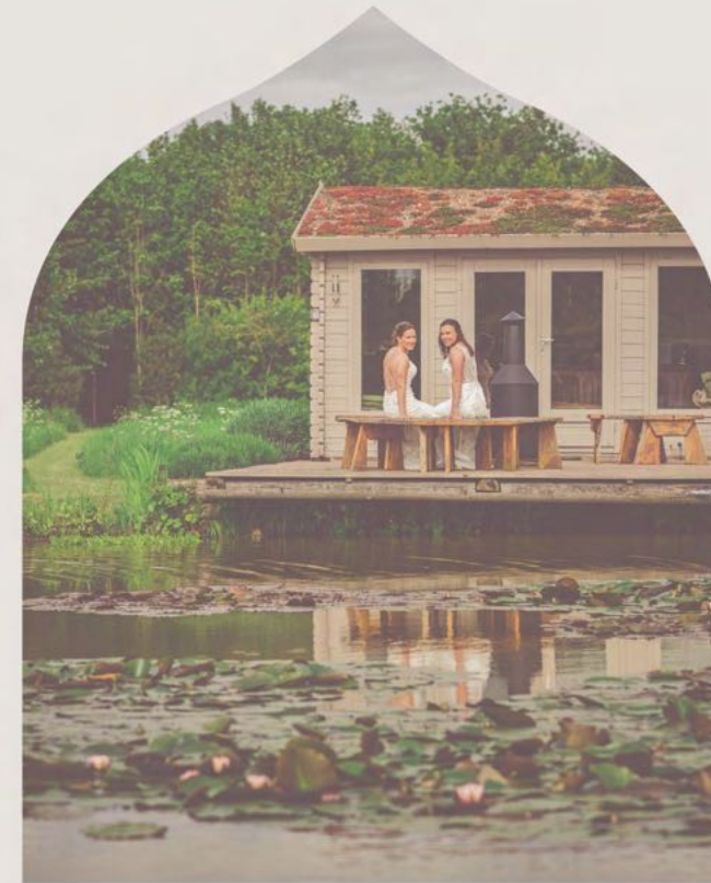
THE TEA HUT