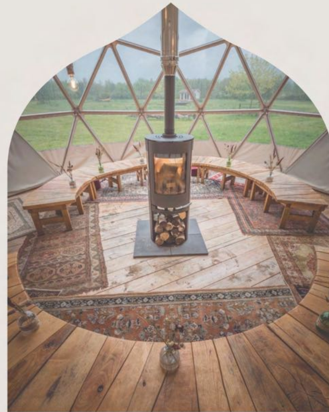
THE GRUB HUB