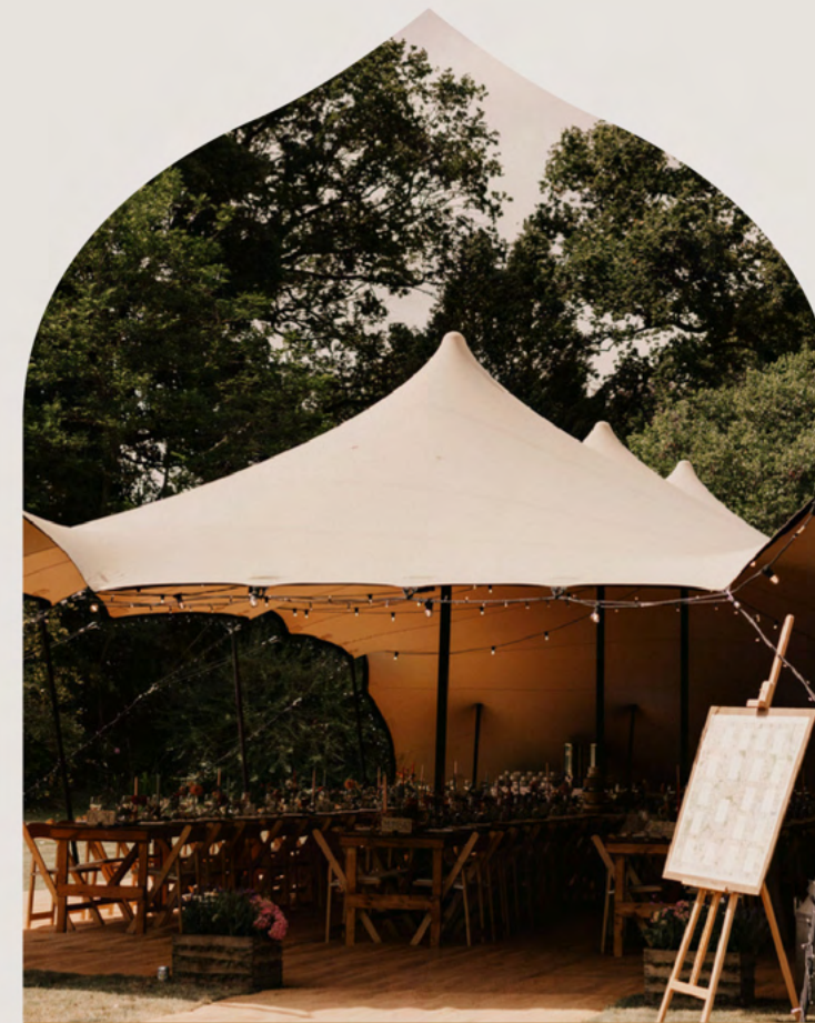
Pretty festoon lighting creates a party atmosphere.