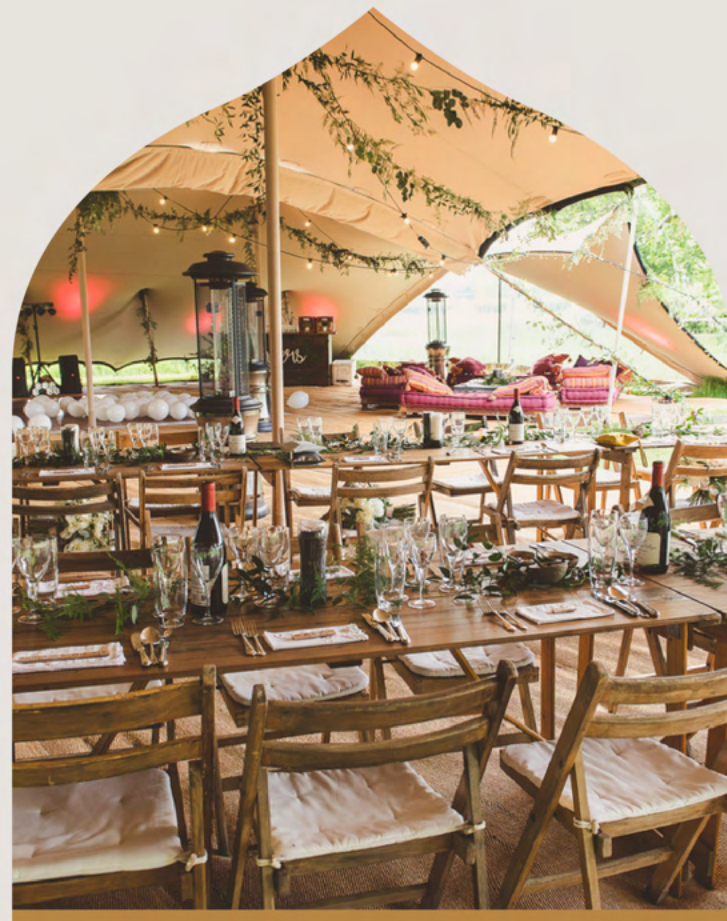
3/6 and three 3/8 solid hand-made solid wooden trestle tables for dining.