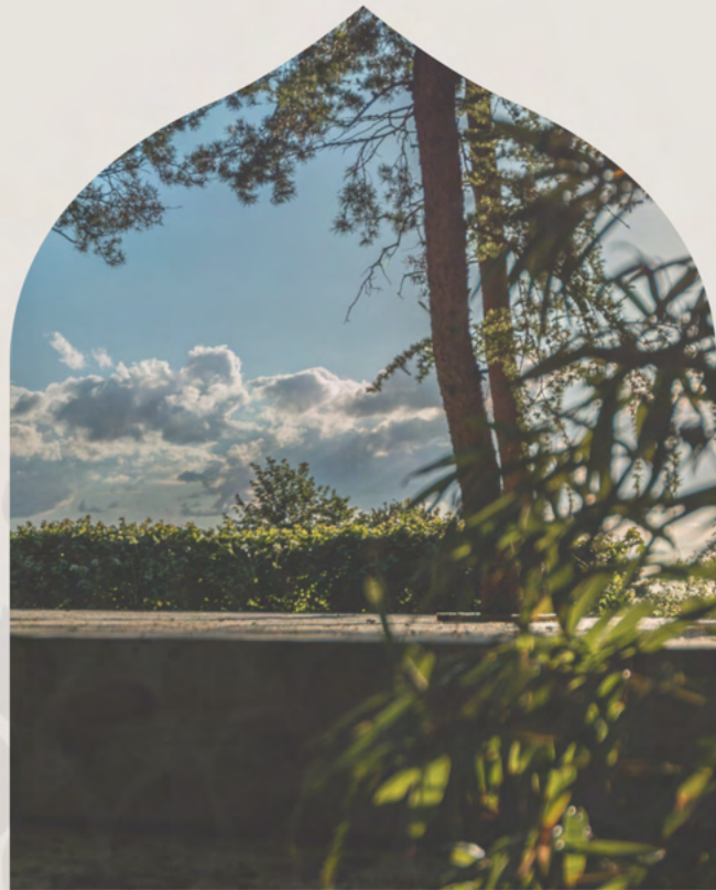
THE SUNSET DAIS

At Purusha we've lots of dreamy spaces both indoors and out for you to use during your celebration to give you plenty of options on how to plan your day.