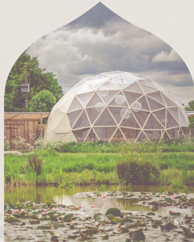
THE KULA DOME