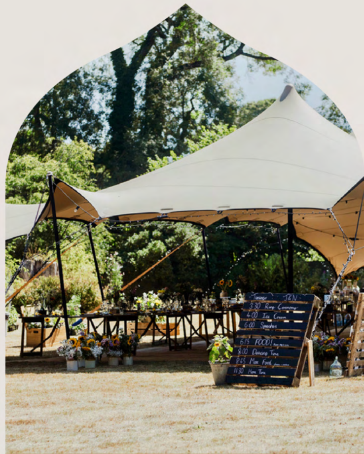
Can seat xx guests for dining at trestle tables.

The stretch tent looks out over our lily-pad pond and is a decor dream. We can dress the tent with festoon lighting, a pallet sofa for stylish lounging and jute flooring to create a beautiful alfresco celebration space.