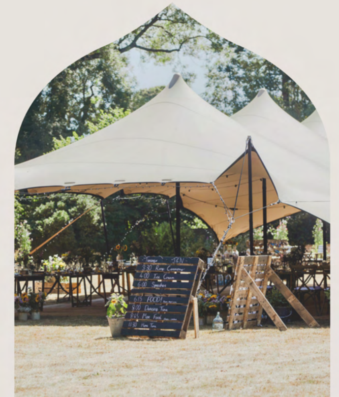
THE STRETCH TENT