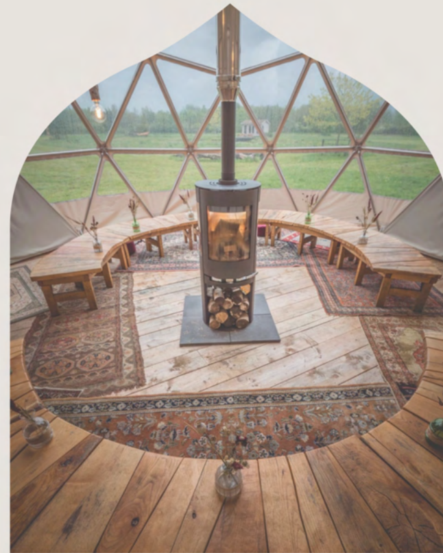
THE GRUB HUB