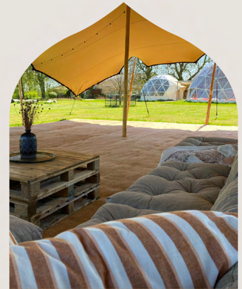
20 bean bags and a pallet sofa for more relaxed seating