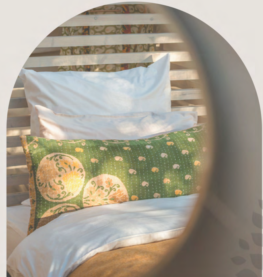
OUR ECO-LUXE ACCOMODATION