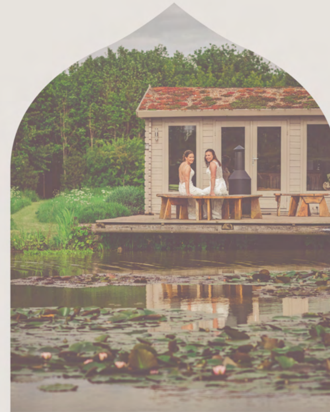
THE TEA HUT